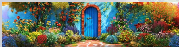
El Jardin De Maa Gansa