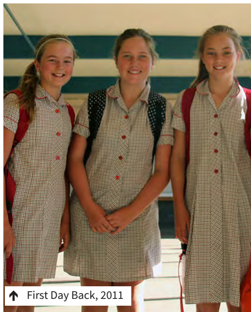
↑ First Day Back, 2011