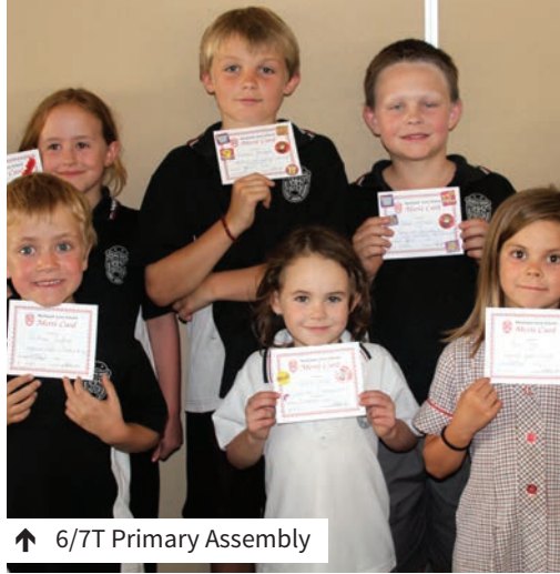
↑ 6/7T Primary Assembly