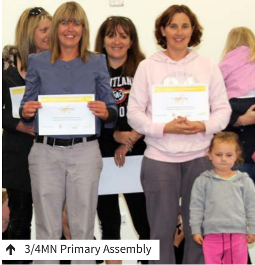
↑ 3/4MN Primary Assembly