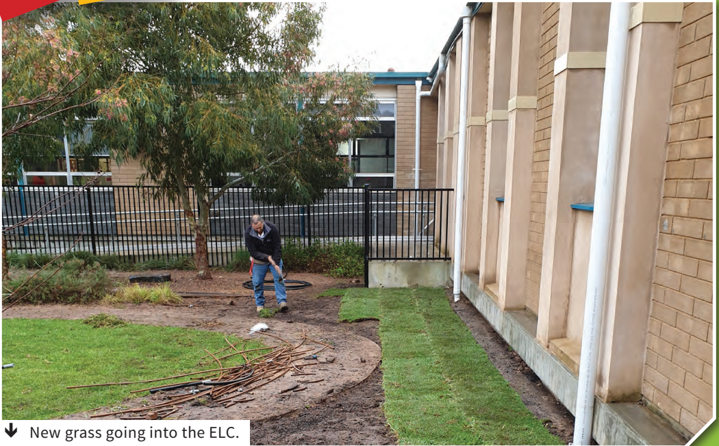
↓ New grass going into the ELC.