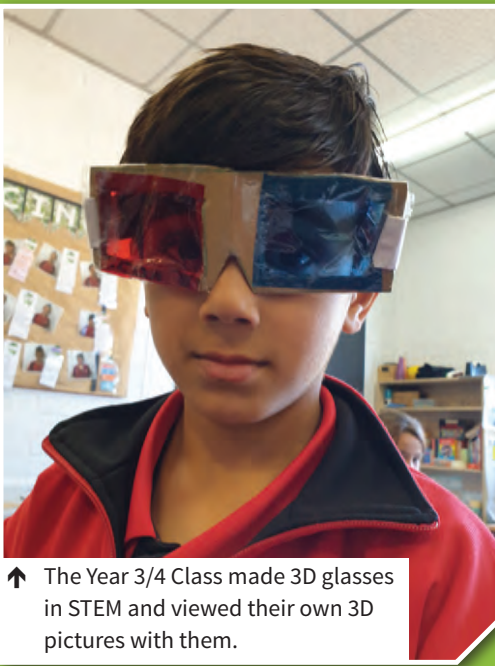
↑ The Year 3/4 Class made 3D glasses in STEM and viewed their own 3D pictures with them.