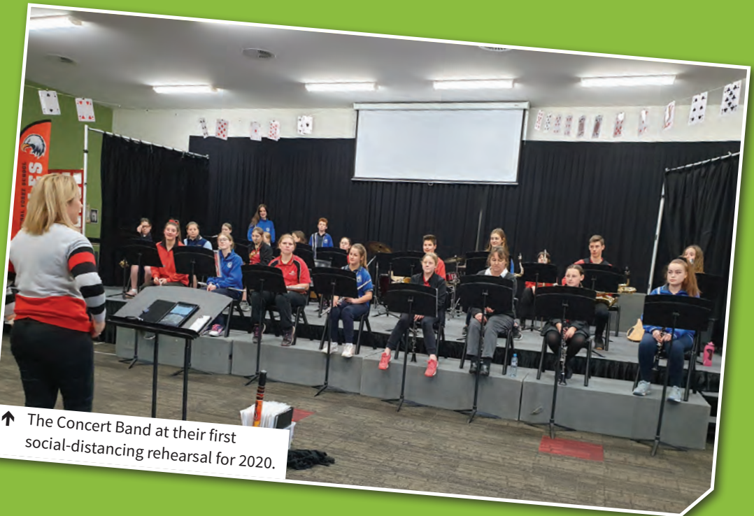
↑ The Concert Band at their first social-distancing rehearsal for 2020.