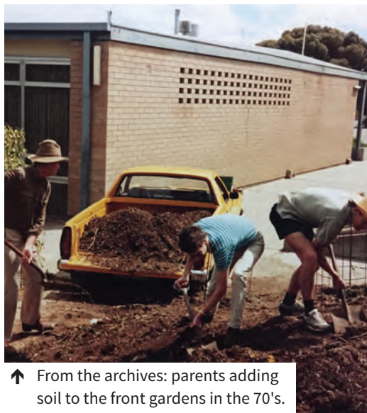
↑ From the archives: parents adding soil to the front gardens in the 70's.