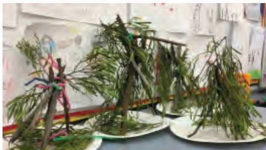
↑ More wardli models from the class.