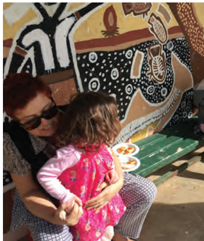
enjoying our shared lunch.