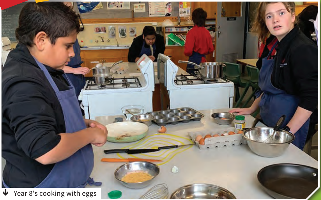
↓ Year 8's cooking with eggs