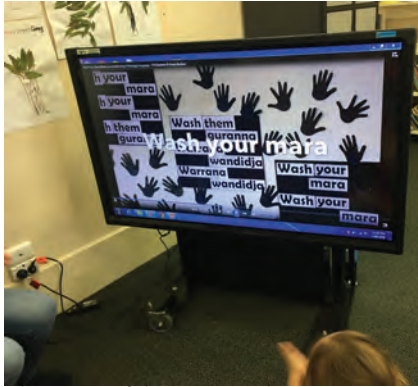
↑ Copy of the song on the screen.