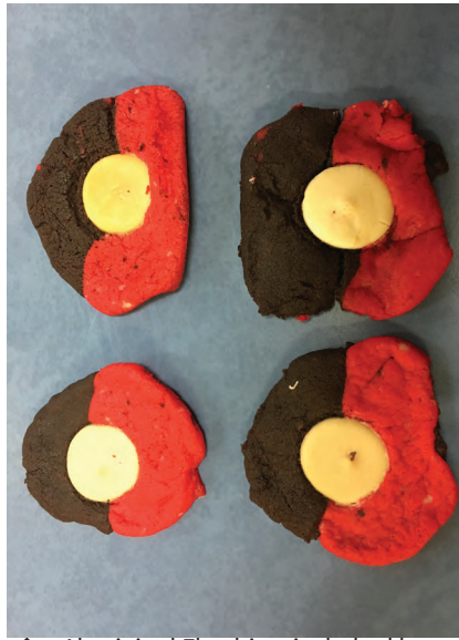
↑ Aboriginal Flag biscuits baked by our kids

We then had a shared lunch which was enjoyed by all. One of the highlights on the menu were the Nunga Flag Biscuits which the children had prepared and baked the day before. We plan to ensure that even more people are involved next year.