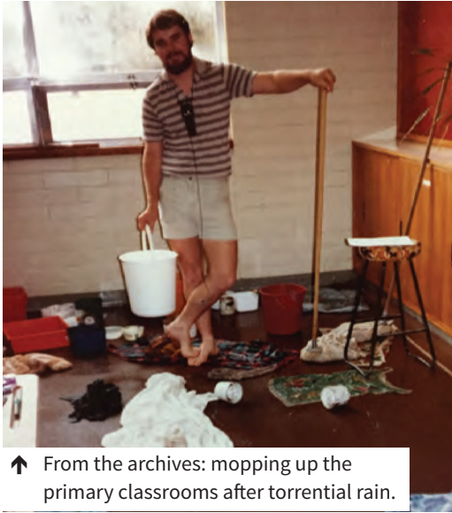
↑ From the archives: mopping up the primary classrooms after torrential rain.