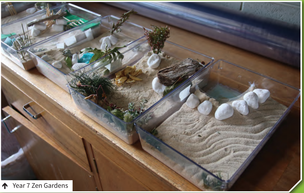
↑ Year 7 Zen Gardens