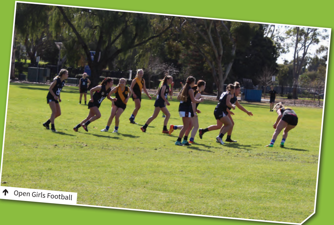
↑ Open Girls Football