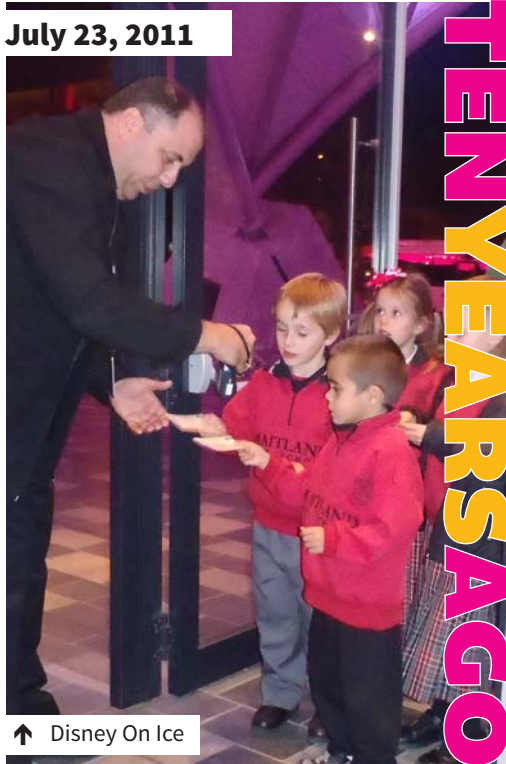
↑ Disney On Ice