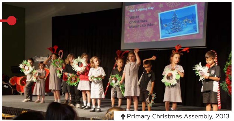
↑ Primary Christmas Assembly, 2013