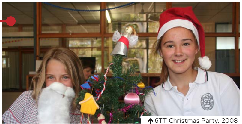
↑ 6TT Christmas Party, 2008