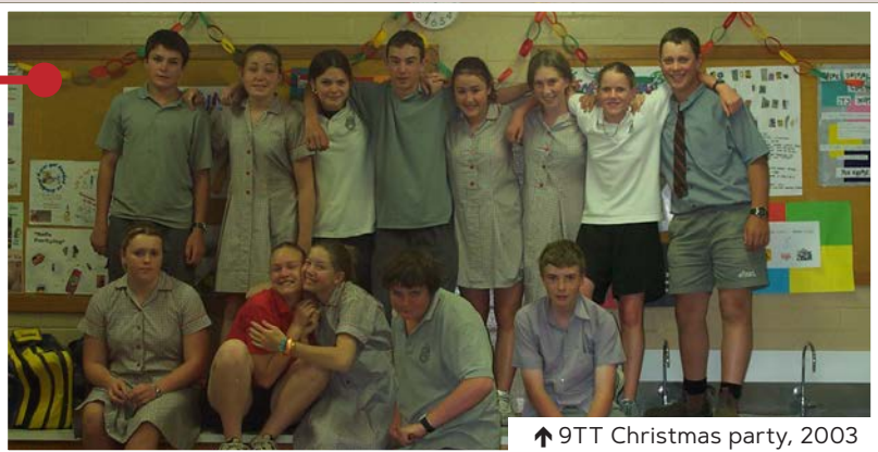
↑ 9TT Christmas party, 2003