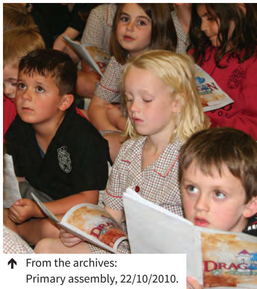
↑ From the archives: Primary assembly, 22/10/2010.