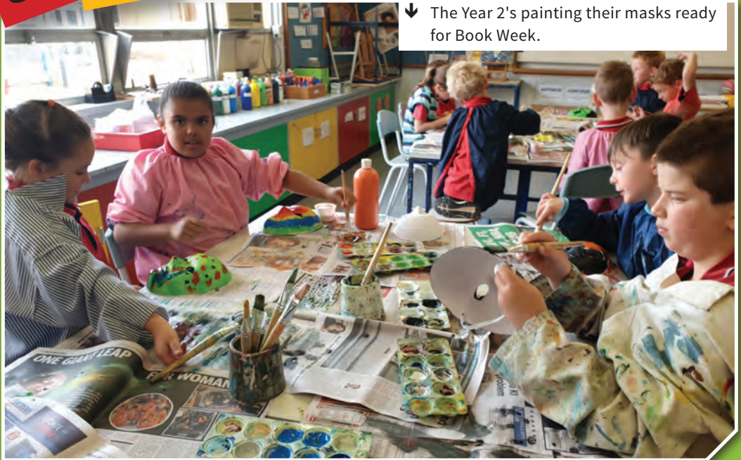
↓ The Year 2's painting their masks ready for Book Week.