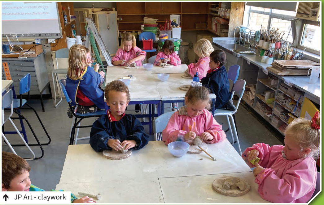
↑ JP Art - claywork