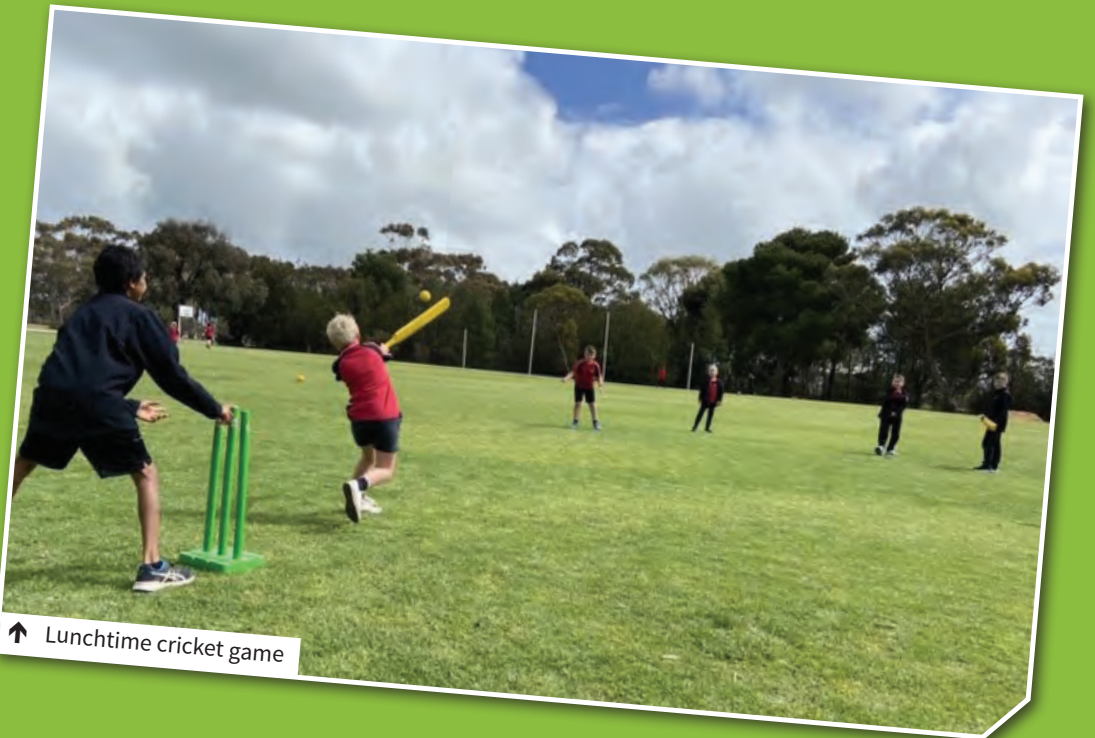
↑ Lunchtime cricket game