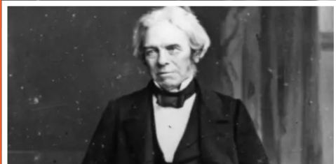
Created the concept of the magnetic field.