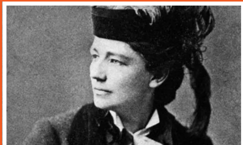
First woman to run for President of US.