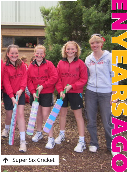
↑ Super Six Cricket