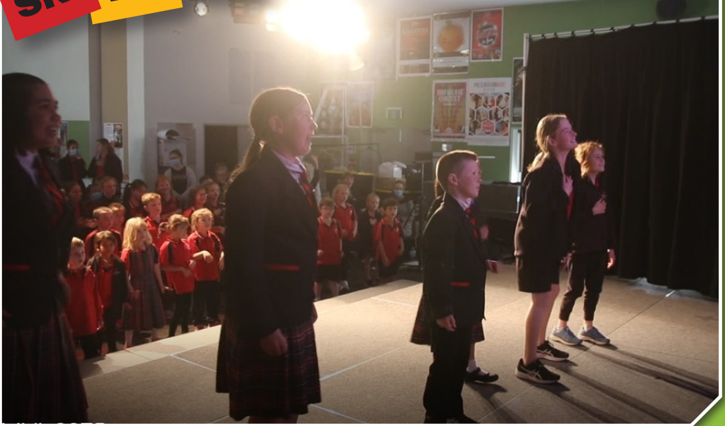
↓ SRC leading the mid-assembly 'Dance Break'.